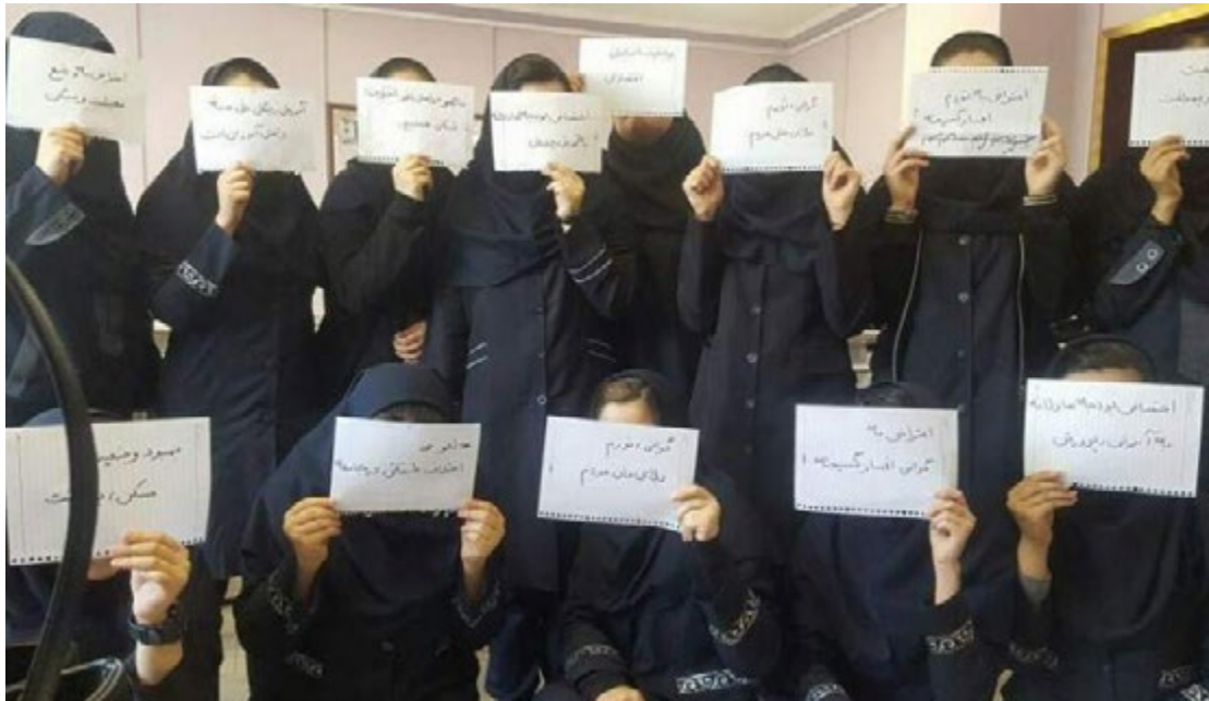
Solidarity of Students with Teachers on Strike in Iran in 2018

In the past year, teachers gathered frequently in front of government buildings; they launched the "No to the Wage Slip" campaign in June and burned their payrolls. In December, they started the protest against the "Inefficient Supplemental Insurance", and in three rounds (October 14-15, November 13-14, and March 3-5, 2019) they organized strikes and sit-ins across the country.