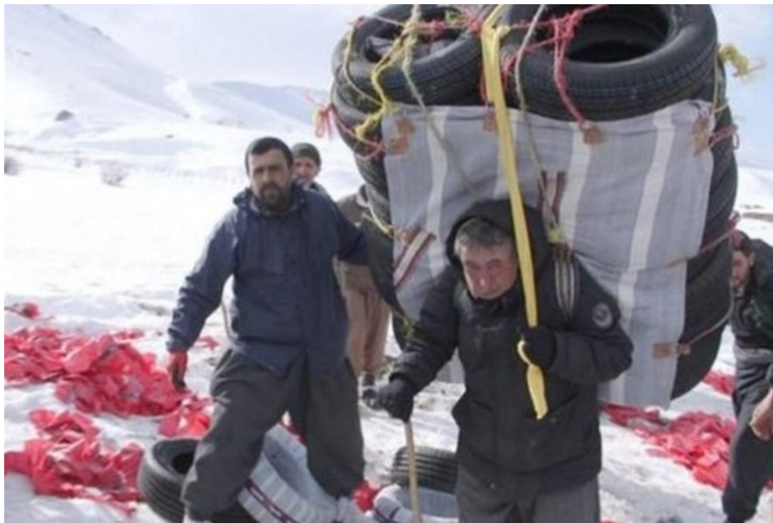
Islamic Republic of Iran treats Kurdish Kulbars (human mules) as a security threat.

Last year, hundreds of Kulbars or human mules - who cross the borders on foot mostly in Iranian Kurdistan, West Azerbaijan, Kermanshah and Ilam - have been killed or wounded. These Kulbars are either killed or wounded by border guards, as a result of fall from heights in mountainous regions they cross or as a result of the explosion of landmines they step on.