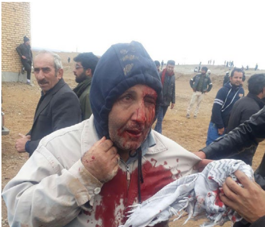
Police attacks Isfahan farmers protests.

The Islamic Republic's reaction to the workers' demands is a police and "national security" approach. On November 26, 2018, the head of the judiciary, Sadegh Amoli Larijani, threatened the workers saying the "enemy" intends to use the tool of "labor demands" to undermine the government. Just one month before the workers' threat by the highest judicial authority in Iran, on October 27, Mohammad Shariatmadari replaced Ali Rabiei in the position of the Ministry of Cooperatives, Labor and Social Welfare. Rabiei had been impeached and dismissed in the parliament in the summer of 2018. Rabiei and Shariatmadari are similar in the sense that they both come from the security apparatuses and have work experience in intelligence institutions.