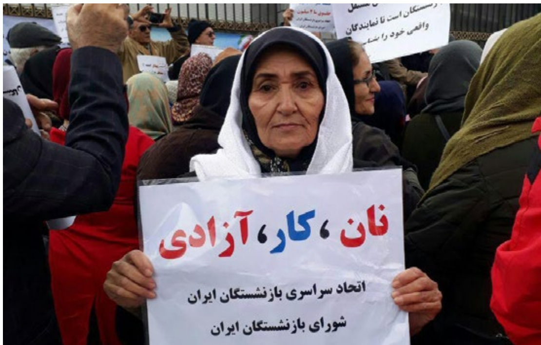
One of the protesting retirees holds a slogan in her hands that says: “Bread, Work, Freedom;” this has become the slogan of many workers’ protests in Iran.

The automotive industry has been hit critically after the US withdrawal from the nuclear agreement. According to the secretary of the Iranian Specialized Manufactures of Auto (ISMAPA), from January to December 2018, about 280,000 workers employed by contractors have been suspended. Similarly, stopping more oil, gas and petrochemical projects in South Pars Energy Special Economic Zone last summer has caused a wave of workers' expulsions.