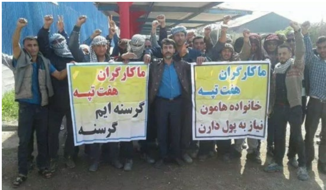
Haft-Tappeh Sugarcane Workers go on Strike in Khuzestan, Iran. One of the banners reads: "We the workers of Haft-Tappeh are hungry."

Municipal workers in many parts of Iran face wage arrears and lack of job security. In some areas, delays in payment of wages have reached about one year. The heart of the problem is the violation of the law by contracting companies and widespread financial corruption in the city's municipal councils.